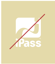
DO NOT reverse the logo on too light a background

The examples below illustrate a number of incorrect uses and are not intended to be a complete list. Never apply these examples.